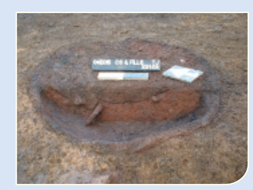
This Iron Age hearth was also discovered at Ballynacarrick, it was dated 180 BC - AD 70.

were also recovered. A Neolithic plano-convex flint knife was found within a second pit over 7 m long and up to 2.6 m wide. Provisional interpretation suggests that it may have been a corn-drying kiln or a butchering pit. Neolithic pottery was recovered. Charcoal from this pit was dated to the Early Neolithic, 4040 – 3940 BC. It may be that this feature and the circular structure were contemporary.