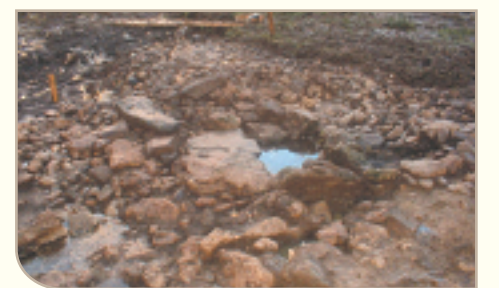
Tobershannon holy well during excavation.

potential archaeological features identified during the course of the Environmental Impact Assessment carried out in 2001. Intensive archaeological testing was carried out along the length of the route, to identify any other archaeological features or complexes not visible above ground. The outcome of the extensive archaeological work was the identification and full excavation of a number of archaeological sites along the route of the bypass. The archaeological works were carried out by Irish Archaeological Consultancy Services Ltd, (IAC Ltd) on behalf of the National Roads Authority and Donegal County Council.