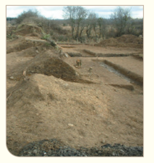
View of linear earthwork at Magheracar.

A nearby furnace contained substantial quantities of slag and charcoal. The furnace was composed of a small pit with a linear flue-like gully several metres